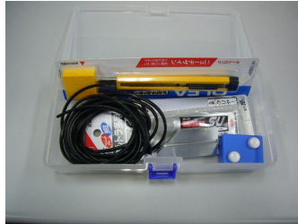
EO Ring Kit