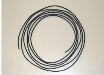
EO Ring Code

EO Ring with ellipsoidal cross-section can be arranged for any length & size you want !!!